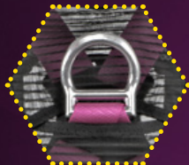
ATTACHMENT D-RING: A