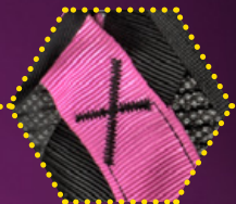
WEBBING COLOR: Hi-Viz