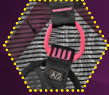
ATTACHMENT LOOP: A/2