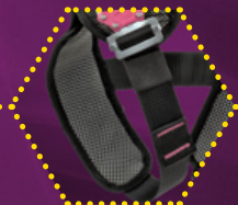
MOVABLE PADS ON THIGHS